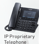
IP Proprietary Telephone