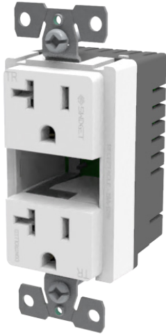
20A, 125VAC 5VDC, 2.0A NEMA 5-20R