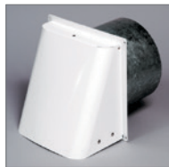
Exterior Hood included