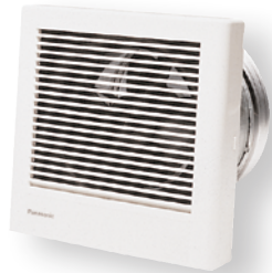
FV-08WQ1 70 CFM