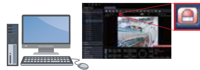
Notification sent to the monitoring screen

i-VMD : Intruder Detection, Loitering Detection, Direction Detection, Scene Change Detection, Object Detection, Cross Line Detection