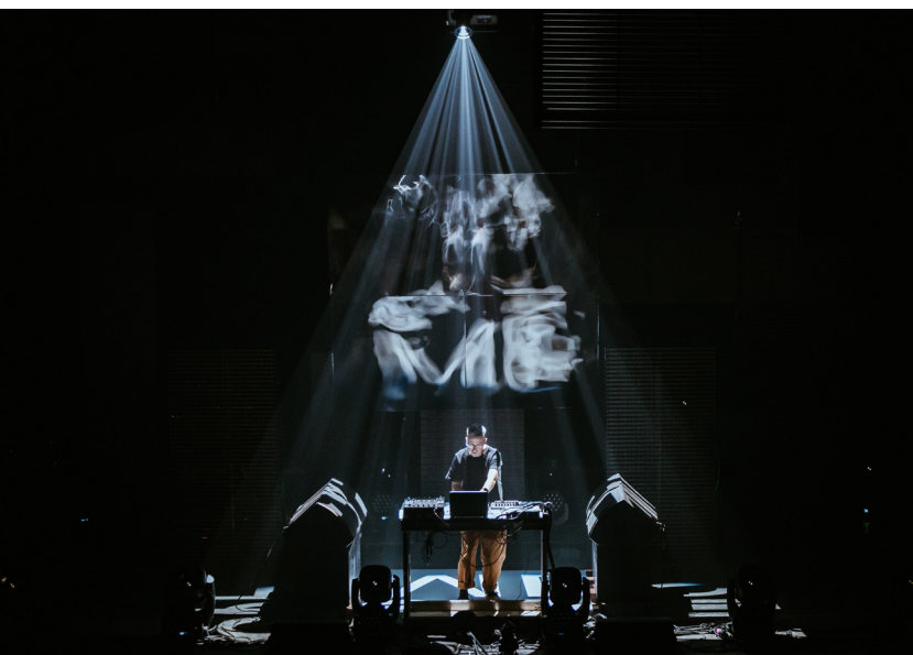
Phœk/Iregui at MUTEK Nocturne

The MUTEK 2021 live/online hybrid festival featured 148 live electronic music performances and an exhibition of digital works and installations at several venues around Montreal and on the web. As part of the festival's online component, MUTEK recorded its Nocturne series of shows, an electronic cabaret of the most rhythmic, enchanting artistic expressions from across Canada, and then streamed these live performances for a global audience on its virtual platform .