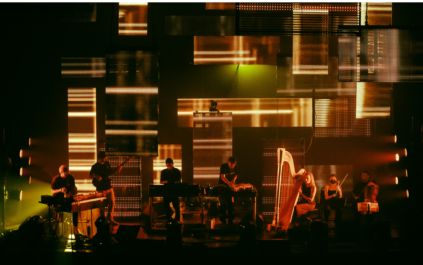
Porto Porto at MUTEK Nocturne