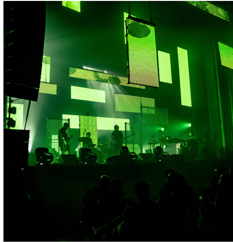
Yu Su at MUTEK Nocturne

"By and large, the artists themselves were pretty blown away by the results, and these aren't people who are necessarily easy to please," says Benjamin. "The feedback we've had is, 'Wow, it looks amazing, it sounds amazing, thanks so much.' I don't think we've had anything but positive comments."