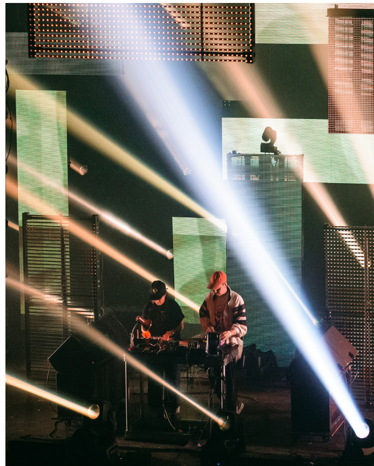
Phèdre at MUTEK Nocturne - Photo: Sean-Vadaru

MUTEK achieved the video production values and rich online experience they were hoping to deliver. The team reformulated the Nocturne shows into a series of six programs that were streamed on MUTEK's virtual platform during the festival, presenting talented homegrown artists to electronic music fans around the world.