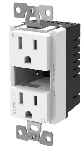
15A, 125VAC 5VDC, 2.0A NEMA 5-15R