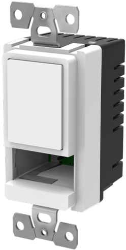
5A, 125VAC 5VDC, 2.0A Single, 3 Way