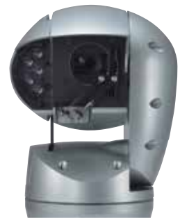
WV-SUD638 (Natural Silver) WV-SUD638-H (Gray) WV-SUD638-T (Brown)